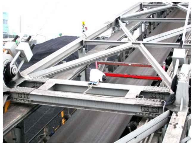
LM2D typical Reclaimer installation