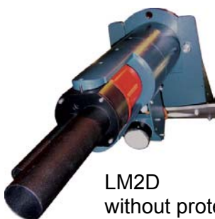
LM2D without protective cover